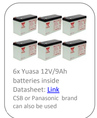
6x Yuasa 12V/9Ah batteries inside Datasheet: Link CSB or Panasonic brand can also be used